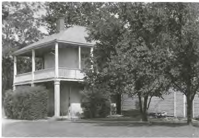
This photograph, showing the enclosed balcony on the back of the house, and its architectural drawing were part of the Historic American Buildings Survey from 1936. During the time the Kellum-Noble House (called the "Shelter House") was surveyed, it served as the Parks Department headquarters.