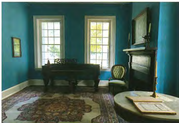
The restored parlor in the Kellum-Noble house, 2019.

Those familiar with Houston history may be able to tell you that the oldest house in the city still standing on its original property is the 1847 Kellum-Noble House in Sam Houston Park. Although owned by the City of Houston, The Heritage Society (THS), a non-profit organization, has maintained the home for the past sixty-five years. Recently, THS completed phase two of an ambitious three-phased project to stabilize the building's foundation and address the significant cracks in the brick walls. Its story, however, goes much deeper than the bricks that make up the building.