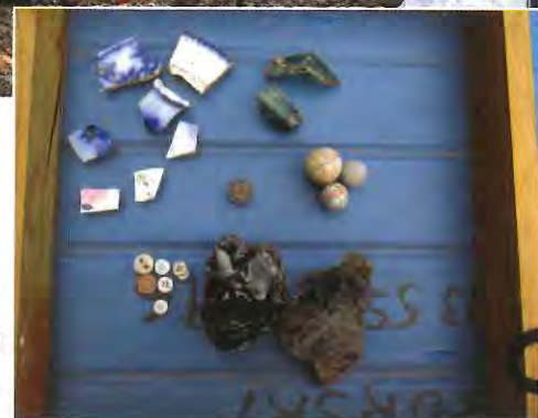
Artifacts uncovered during the dig.

During this project, the floors were carefully taken up and stored and twentieth-century subflooring was removed. With great surprise and delight, artifacts were found in the dirt underneath, and the Houston Archeological Society