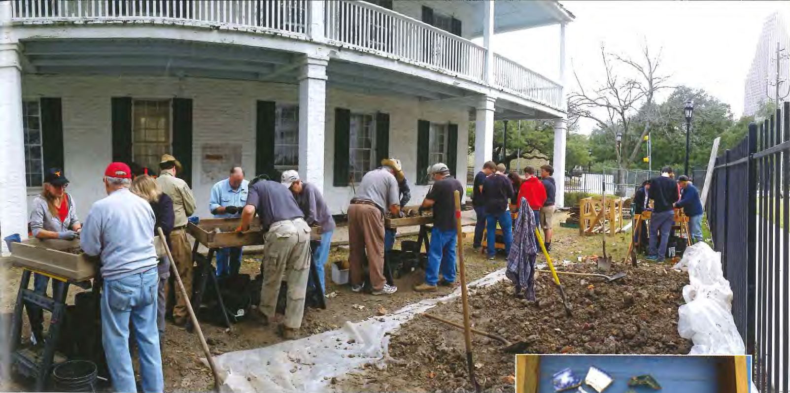
Dozens of HAS members worked in coordination with the Texas Historical Commission to uncover artifacts found below and around the Kellum-Noble House.