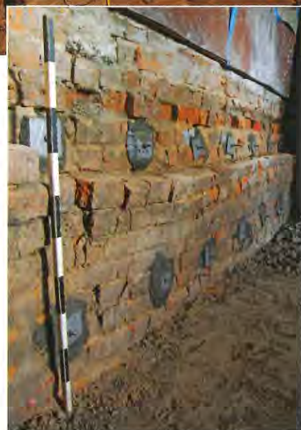
Rarely is the progress of a historic preservation project shown from the inside. These Phase I renovations were completed in 2017. Although the Kellum-Noble House received no damage from Hurricane Harvey that year, it caused a long delay in beginning Phase II of the renovations.