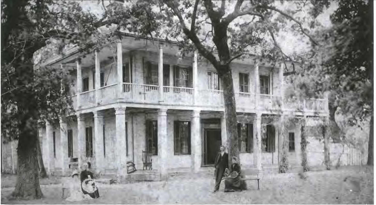
The Noble family in front of their home, circa 1890. Two features differ significantly from the house's twentieth-century appearance: The roof is clad in standing seam metal with a half-round gutter, and the columns are more numerous and configured differently than today. Closer inspection reveals a slightly different balustrade and a different pair of doors on the primary façade upstairs.