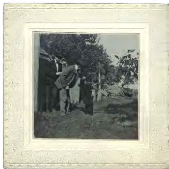
A bear cub at the zoo at Sam Houston Park, 1903.