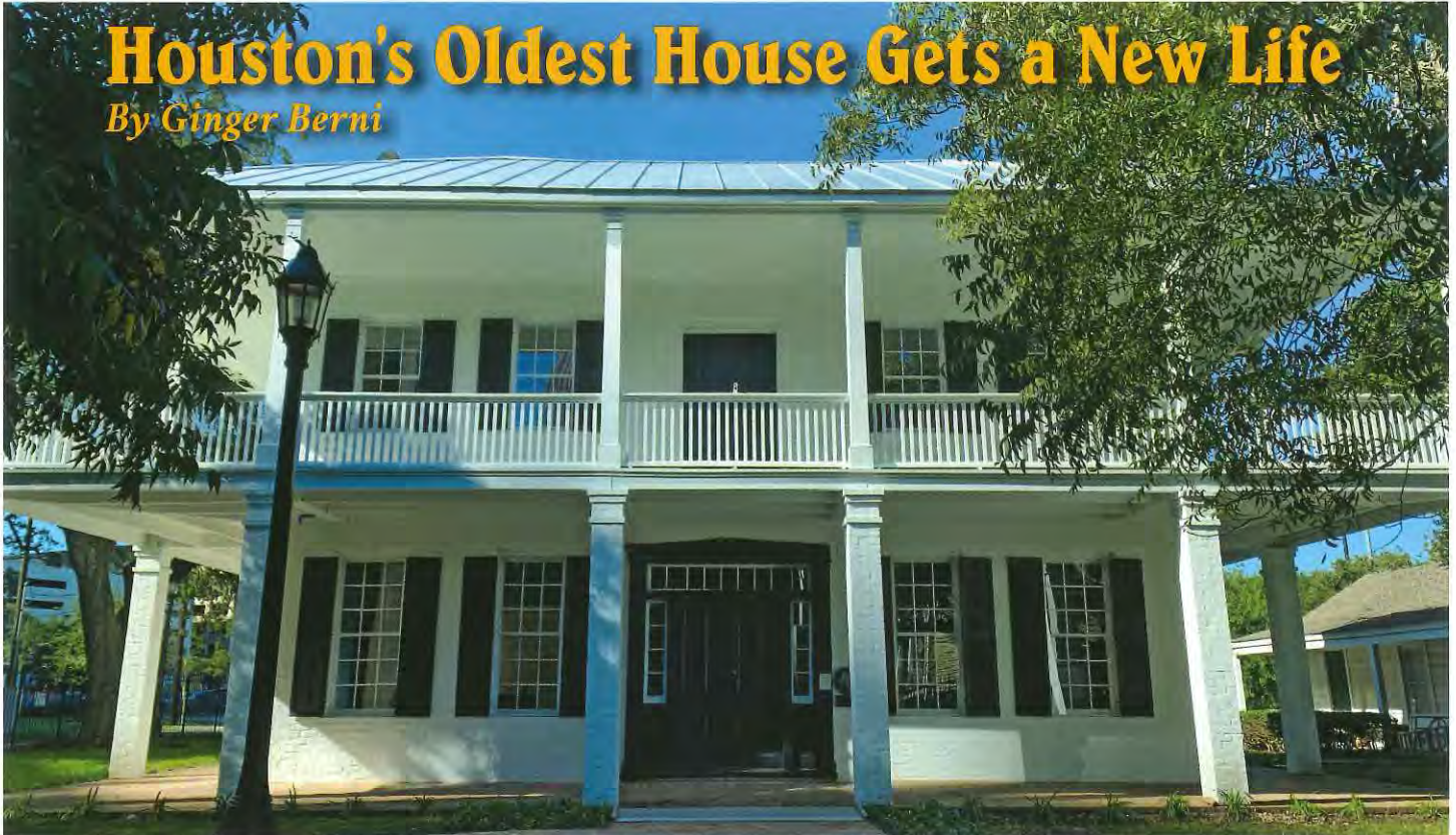
The exterior of the newly renovated Kellum-Noble House in 2019.